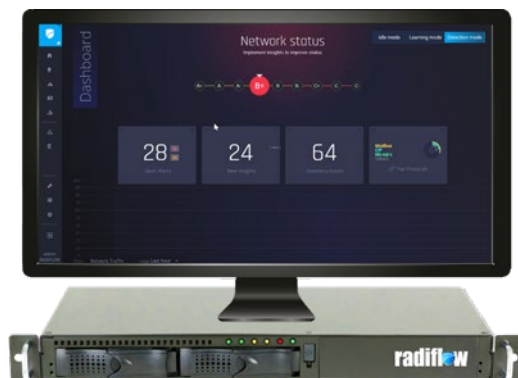
In addition to threat detection using multiple security packages, iSID provides industrial operators full network visualization, as well as risk mitigation insights

iSID's multiple security engines offer capabilities pertaining to specific type of network activity: modeling and visibility of OT and IT devices, protocols and sessions; detection of threats and attacks; policy monitoring and validation of operational parameters; rules-based maintenance management; and networked device management.