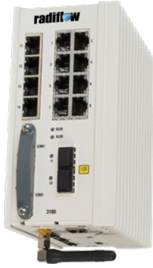
The iSEG-3180 Ruggedized Secure Gateway provides DPI firewall capabilities, as well as an APA (Authentication Proxy Access) for rule-based user access management

In addition, to facilitate compliance with local regulations, the iSEG RF-3180 includes APA (Authentication Proxy Access) for authenticating and limiting users' access to predefined devices and functions, all fully logged.