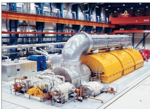
Typical production turbine used in large-scale powerplants. The project described called for each turbine to be secured individually.

The combination of these two factors led the operator, one of the largest energy utilities in Central Europe, to seek a cyber-security solution for its main power generation plant.