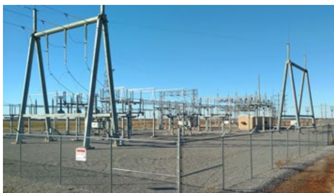
One of the Radiflow-equipped substations included in the project

Radiflow's iSIM is a powerful centralized management tool for all of the 3180's features, including ACL management. It presents a network topology map in both logical tree structure and graphical map. In addition, iSIM supports pre-scheduled software updates and database backups.